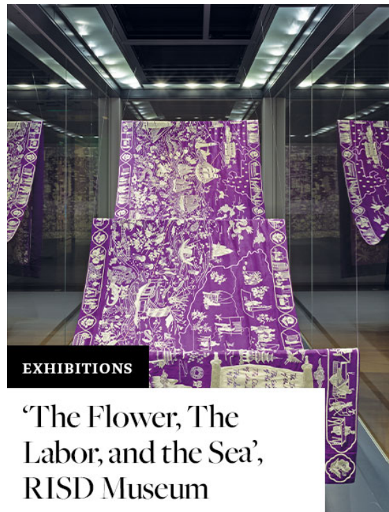
‘The Flower, The Labor, and the Sea’, RISD Museum

Visit the Museum of International Folk Art website for more information.