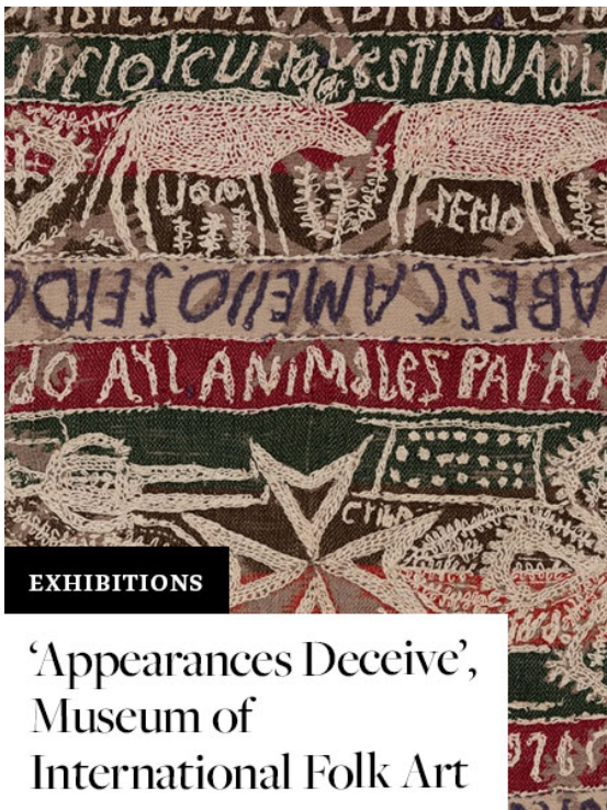
‘Appearances Deceive’, Museum of International Folk Art

Visit the MAK website for more information.